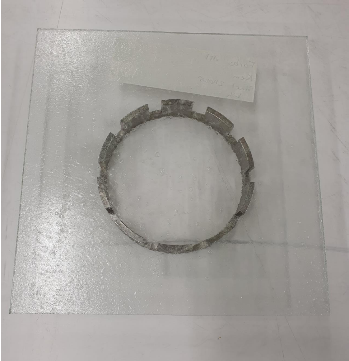
Specimen for the chemical emission